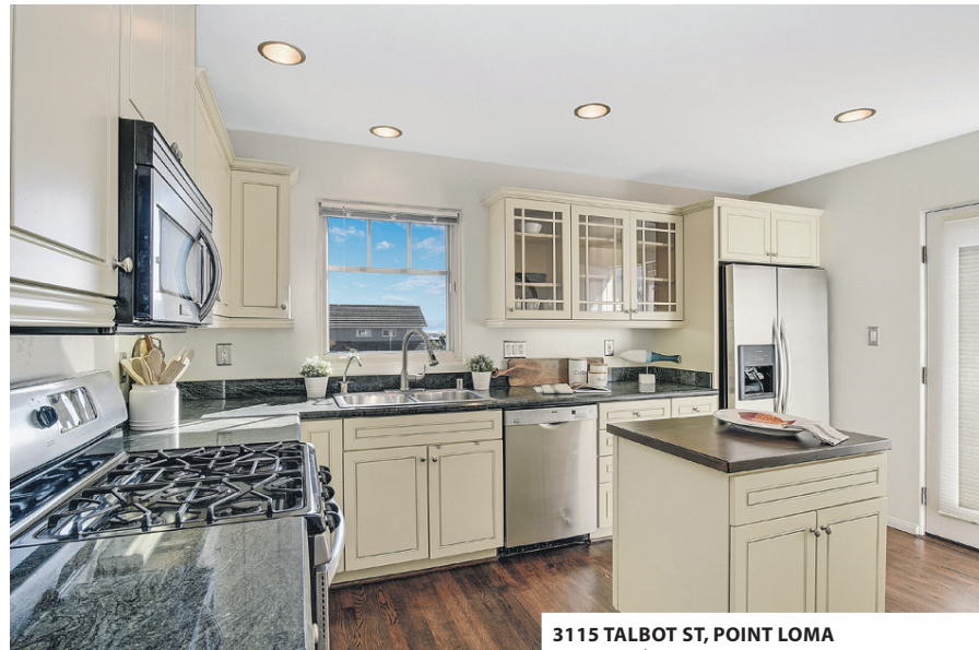
3115 TALBOT ST, POINT LOMA 5BR/3BA • $2,480,000 • 619.890.2828

TAKE A VIRTUAL TOUR at bhhsocalifornia.com