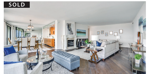
1150 ANCHORAGE LANE #602, POINT LOMA 2BR/2BA • $1,585,000 • 619.227.LIST

TAKE A VIRTUAL TOUR at bhhsocalifornia.com