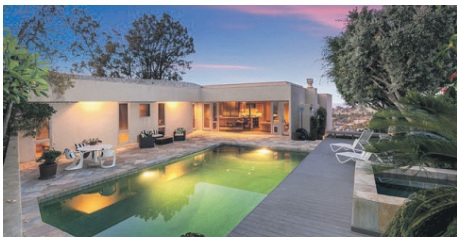
1080 MUIRLANDS DR, LA JOLLA 5BR/3.5BA • $6,980,000 • 858.551.6630