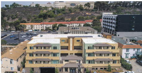
5226 LAURETTA ST, SAN DIEGO 30-Unit Apt Bldg • $19,500,000 • 858.859.3370

BERKSHIRE HATHAWAY HomeServices California Properties