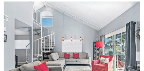
830 ISTHMUS CT UNIT B, MISSION BEACH 3BR/2.5BA • $1,495,000 • 858.859.3370